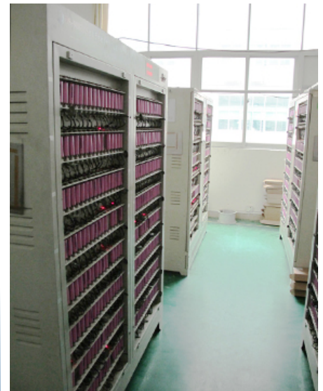
Figure 8: LUXA2 batteries under going battery-burning test

Each and every battery is tested and conditioned for three full cycles (figure 8) to ensure utmost reliability.