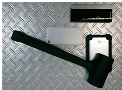
Figure 11: Hammer testing

In addition, we also undertake hammer tests (figure 11) to ensure our portable battery banks are able to withstand the adequate pressures that directly relate to its reliability.