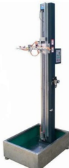
Figure 10: Portable battery bank drop testing machinery with adjustable height.

LUXA2 undertake standard drop tests (figure 10) on all our power banks to ensure they are able to withstand the most common of drops from varying heights. This ranges from heights that cover power banks falling out of your hands, pockets, desk or any other real life situation.