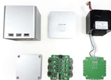
Figure 1: Use of latest circuit board, chipset technology and LG, Samsung battery cells for maximum performance.

In fact, we are so confident about reliability that LUXA2 offer a standard two-year warranty on all our portable battery banks.