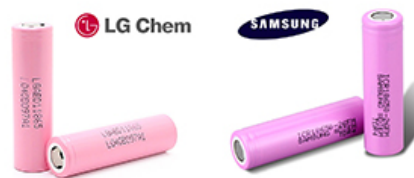
Figure 2: Use of quality battery cells from LG and Samsung.

Use of premium lithium-ion and lithium-polymer battery cells (figure 2) from LG, Samsung, together with hi-grade cells ensure that our battery pack provides that extra bit of juice to your device than that of a standard portable battery bank.