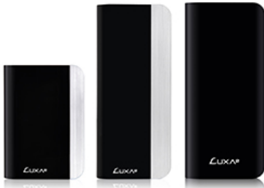
Figure 5: RoHS certifications are labeled on all LUXA2 battery pack products.