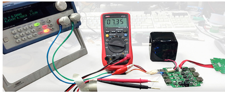
Figure 6.1: Input testing in progress.

LUXA2's power bank circuit boards goes through rigorous input/output testing (figure 6.1) to ensure that devices are charged at the optimized state, meaning that whatever the stated input/output performance (figure 6.2), you're guaranteed to know that the performance is constant to ensure fastest possible charging times.