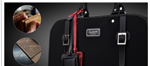
Figure 4: PL leather series hand stitched with skill craftsmanship and care.

LUXA2's leather PL fashion series power banks are all hand stitched (figure 4) and put together with skilled craftsmanship and care to provide that classic finishing touch that only a human can provide.