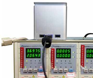
Figure 6: LUXA2 power banks provide up to 90% energy efficiency compared to the average 75% offered by standard power banks

Our battery packs are designed to provide high power conversion rates which is achieved by the use of high-class board circuitry and chipsets (figure 6) that enable them to optimize efficiency and durability.