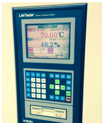
Figure 9.1: Batteries tested to extreme 70°C max and -20° low temperatures ranges.