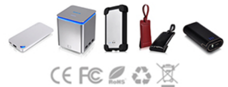
Figure 12: All LUXA2 battery banks conform to the Government specified regulations per required region.

All LUXA2 battery banks conform to the appropriate Government regulatory body (figure 12) with formally received certifications. These include the CE mark certification for portable battery products in the European Economic Area (EEA), FCC Declaration of conformity for electronic products sold in the United States, and the Bureau of Standards, Metrology and Inspection (BSMI) for Taiwan.