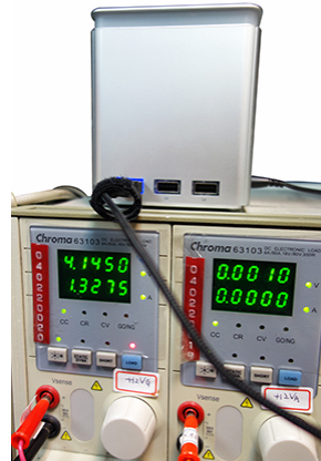
Figure 6.2: 1A Output testing confirming 1.3A output.